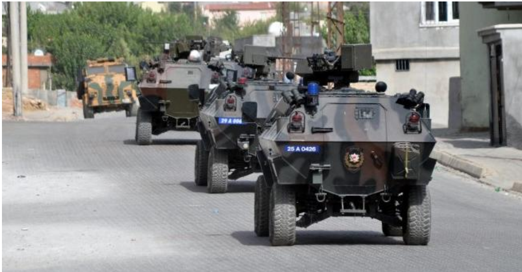
Turkish tanks in Cizre, December 2015

10 days, seven died from their wounds and another 15 were in a critical condition. Police detained 11 women attempting to march to the basement in protest. Ambulances were denied access on multiple occasions. On 9 February, security forces bombed the area, killing 70 to 90 people, including those inside the basement. The government claimed all who were killed were PKK terrorists.