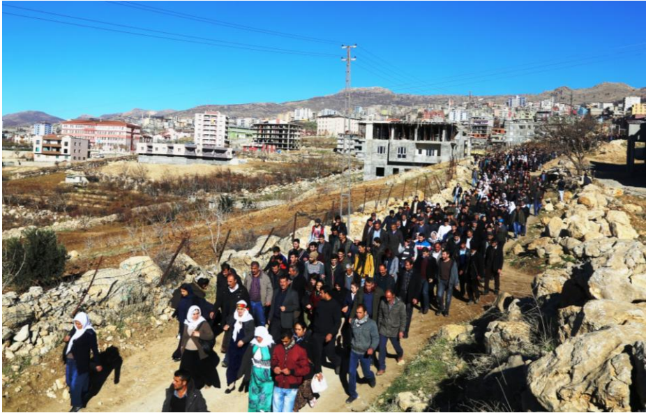
People marching to Cizre and Silopi in protest of the sieges and curfews, December 2015.