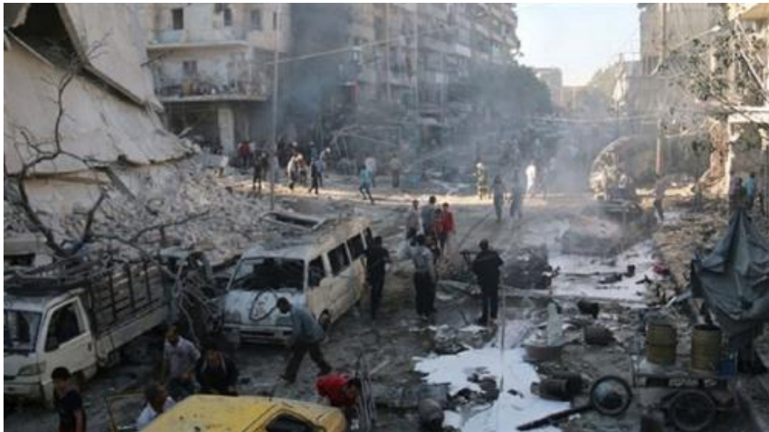
The destruction of Sur, the 7,000 year old centre of Amed/Diyarbakir by Turkish security forces, December 2015