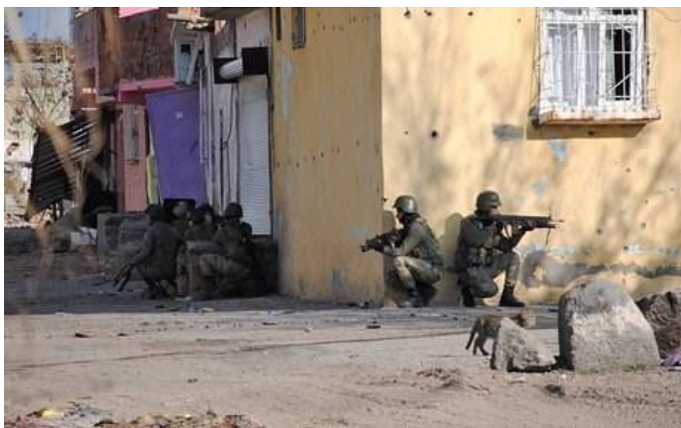
Turkish commandos positioned in Kurdish neighbourhoods, late 2015.

From early December, Turkey seemed to be preparing for full-scale war. The government ordered all teachers and civil servants to leave Cizre and Silopi and for all doctors and health workers to remain. Half the population of Cizre and Silopi either chose or were forced to evacuate. On 14 December 24-hour curfews were reinstated in Cizre and Silopi, and on 17 December, curfews were reinstated in the towns of Nusaybin, Farqin and Lije.