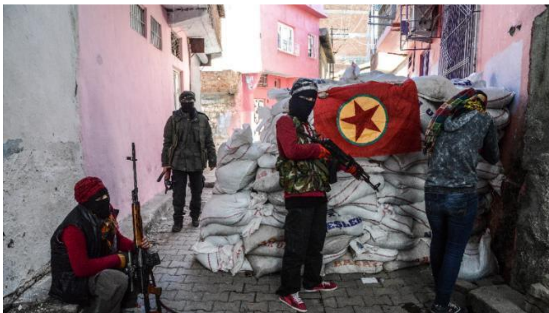
Members of the Patriotic Revolutionary Youth Movement, or YDG-H, Sur, December 2015

In response to the Turkish government's military operations, militant youths belonging the urban-based Patriotic Revolutionary Youth Movement, or YDG-H, which upholds PKK aspirations for democratic autonomy, have built trenches and barricades and armed themselves with Kalashnikovs and hand grenades, to protect the districts under siege. It is these youths with whom the security forces clash. The Kurdish youths say they will only stop resisting if Ocalan orders it, but Ocalan is silent. He has not been allowed visits from non-family members since 6 April 2015, and family have not been allowed to visit him since September 2015.