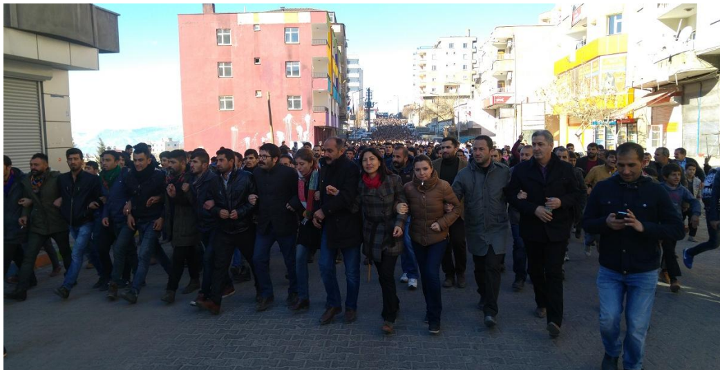
Protesters in Sur, December 2015

Thousands of people continue to protest against the 24-hour curfews in Sur, Silopi and Cizre, which are now entering a third month. Each time they are subject to water cannons and tear gas, and sometimes, artillery fire.