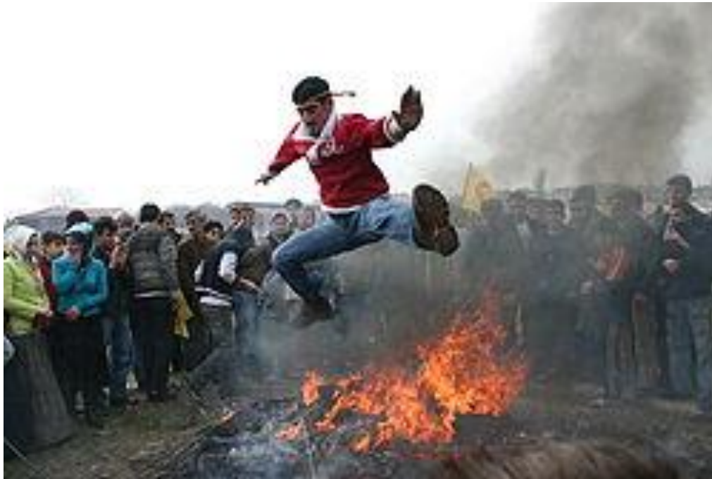
Newroz in Istanbul Turkey

In all versions of the legend, Kawa refuses to become king. Some say Kawa was from the wrong family. According to Firdawsi, Prince Faridoon became king. Some think Zohag was an Assyrian king. In the Shahnameh , Firdawsi, calls Zahak an Arab. In truth, the legend is timeless. For those who know the legend and celebrate Newroz with fire, fire is a symbol of freedom from tyranny.