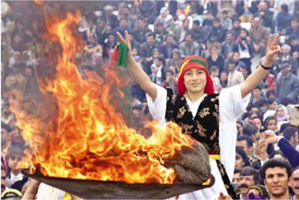
Newroz in Rojhilat – east Kurdistan (north west Iran)