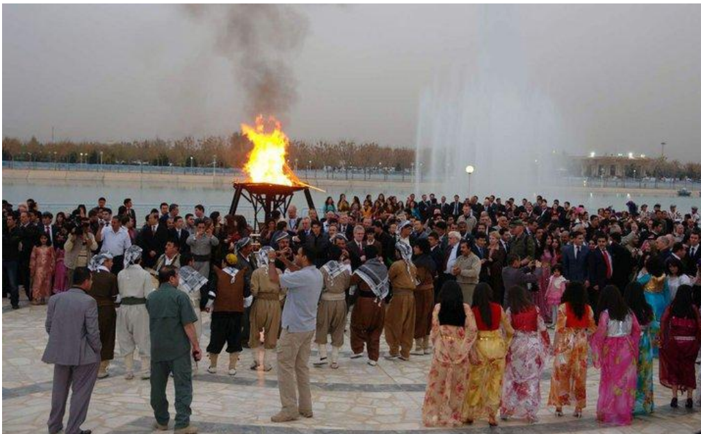
Newroz Rojhilat – east Kurdistan (north west Iran)