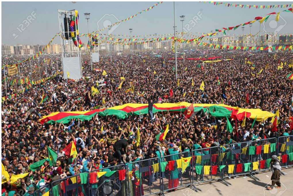
Newroz in Bakur - north Kurdistan (eastern Turkey)