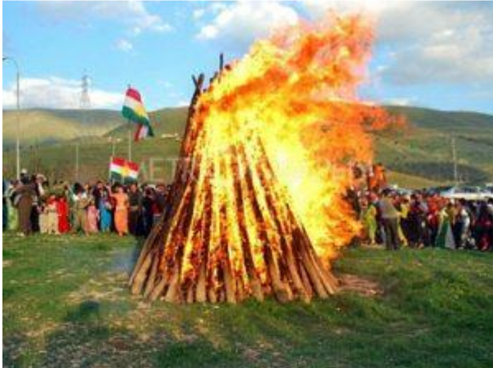
Newroz in Bashur – south Kurdistan (north Iraq)